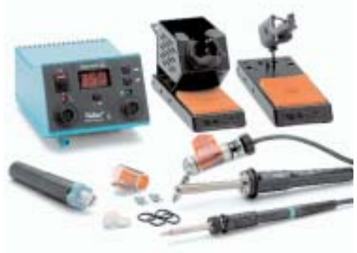
WDD 81V desoldering station