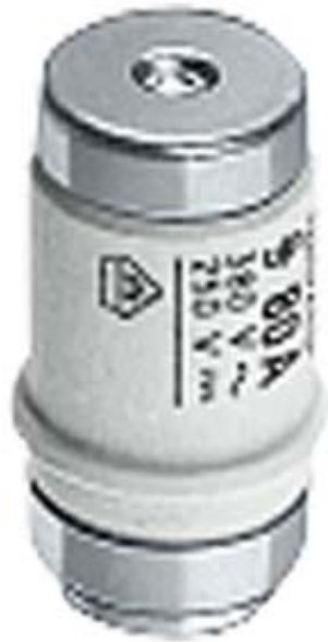
Similar to image

NEOZED FUSE LINK 400V GL, SIZE D02, 35A IN FOLDING BOX