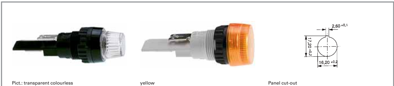
Pict.: transparent colourless