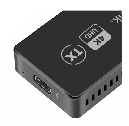
Power supply through DC 5V USB-C port