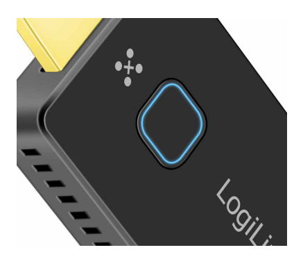
Reset button and LED indicator