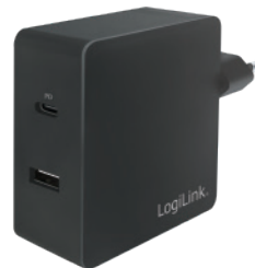
PA0213 USB-C™ 2-Port Wall Charger