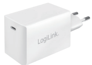
PA0229 USB-C™ GaN Wall Charger