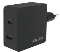
PA0212 USB-C™ 2-Port Wall Charger