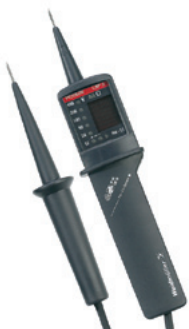
LSP 3 - 400 V