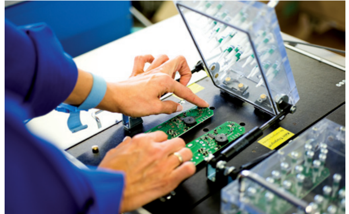
100% testing of all voltage testers

Weidmüller stands for high-quality and has an excellent reputation: The enclosure shells for the two-pole voltage testers are made in Germany, the PCBs for the electronics in Switzerland, using surface mount technology (SMT) soldering, and the final product is assembled across Europe.