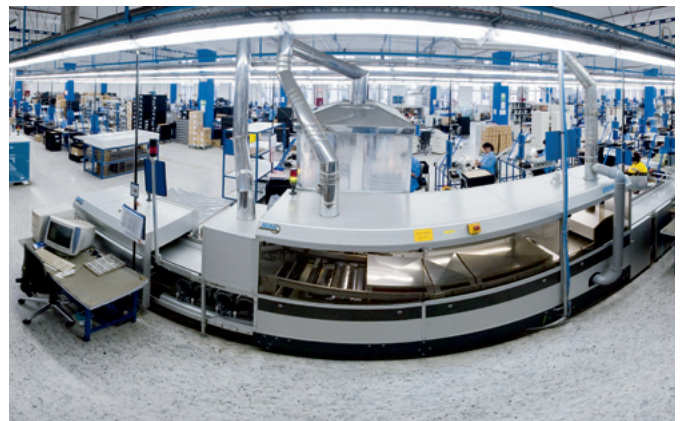
Assembling the tester