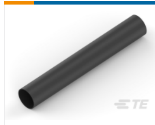
TE Part #NB14882001 DWP-125-1/8-0-STK