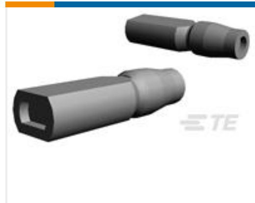
TE Part #2-180930-0 250 FASTON HSG., REC., 1 POS, NATURAL