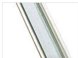
DIN rails for PK 105 - 115, DIN EN 60715 TH 15