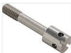
Capstan-headed screws, sealable