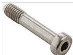
Allen cheese-head screw for lid