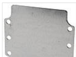
Mounting panels for PK 105 - 115, galvanised sheet steel