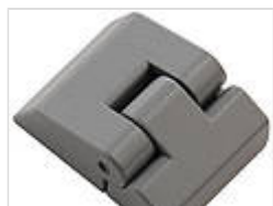
Set of hinges