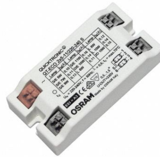
QTP-ECO 2x5-11/220-240 S