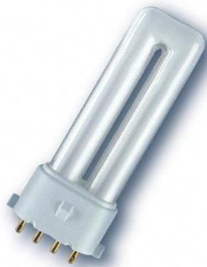
DULUX ® S/E