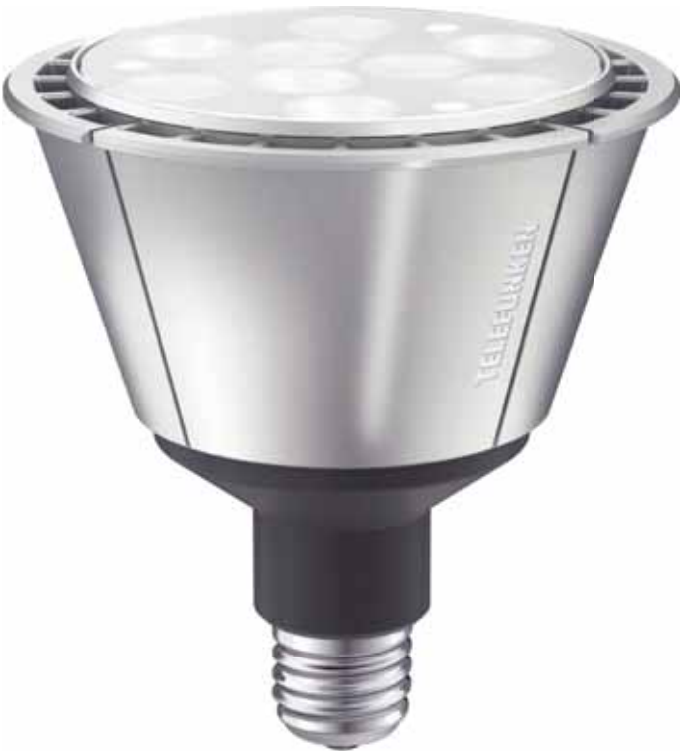
LED PAR38, base E27

For further informations scan the QR-Code or visit www.telefunken-licht.com/PAR38